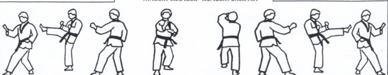
11B. RIGHT INSIDE MIDDLE BLOCK